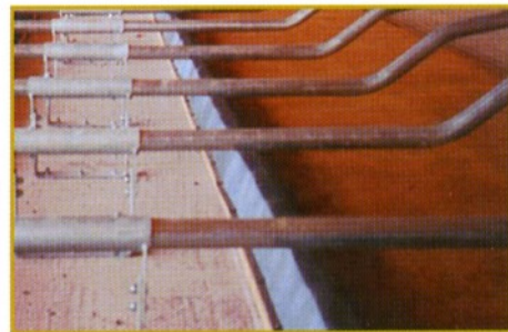
U.S. Patent Des. 421,321 Canadian Design Registration 85188 Norway 74839 U.K. 2069893 Ireland D12010